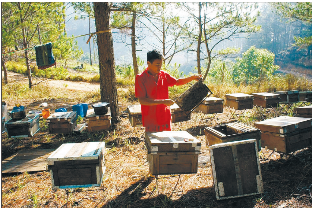
Fig. 2. Domestic honeydew production in forest region of Turkey.