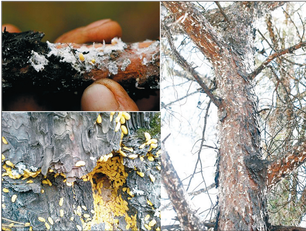
Fig. 1. The scale insect Marchalina hellenica (Hemiptera: Margarodidae) on pine trees – a main honeydew producer in Turkey. Muğla province in Aegean region, autumn period.